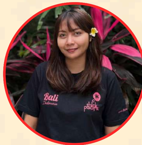
Citra Programme Coordinator