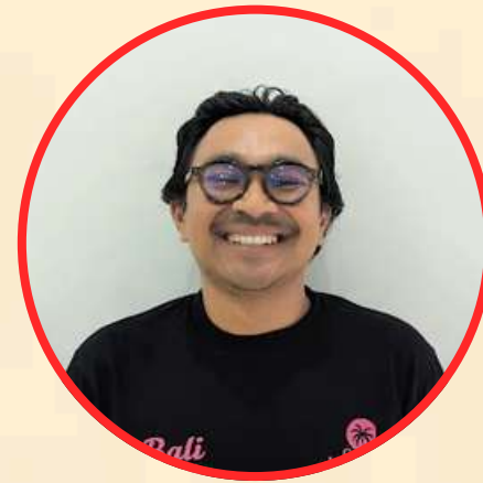
Sumara Operations Manager