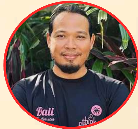
Endra Partnership & Development Manager