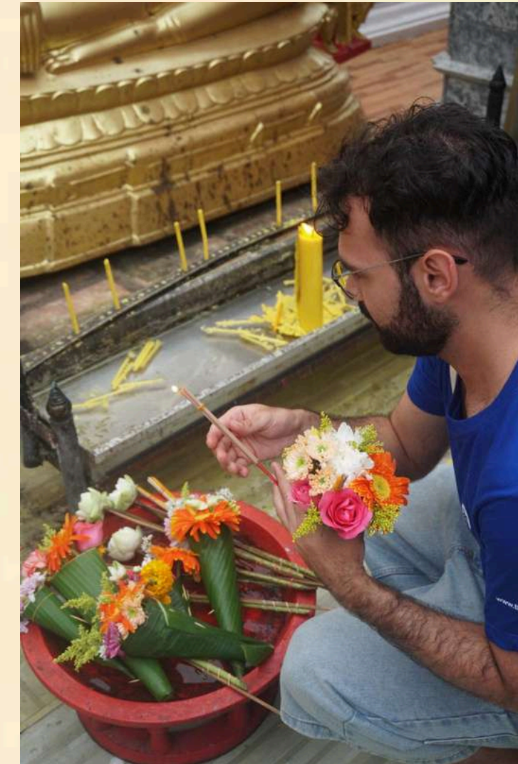
Suay Dok; cone-shaped flower arrangements making and offering for blessings and good luck