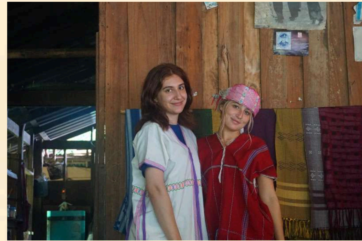
Karen Village visit, wearing traditional handcrafted clothing