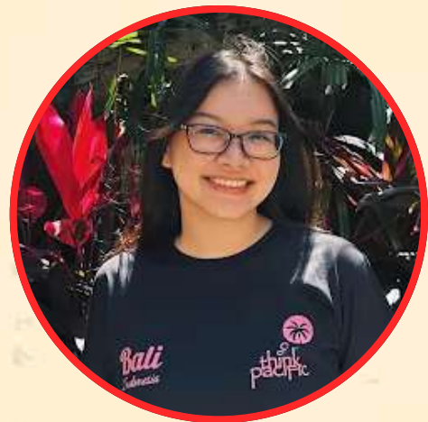
Mey Mobility Manager