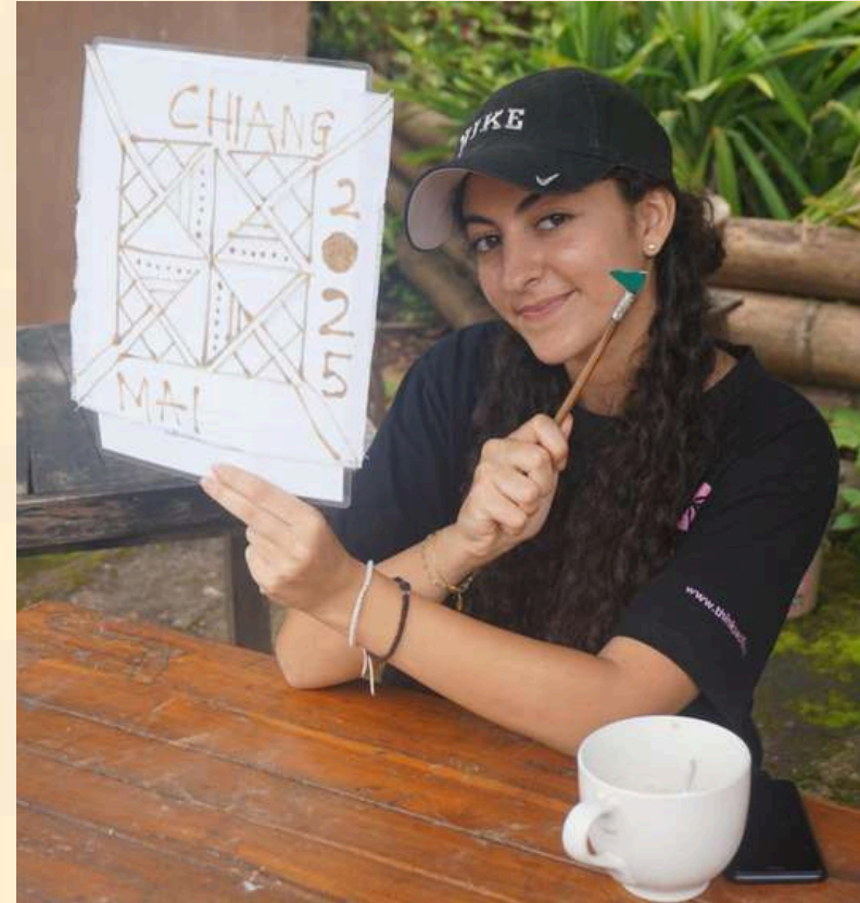
Batik; traditional fabric art made by using wax to create patterns during an Hmong Village visit