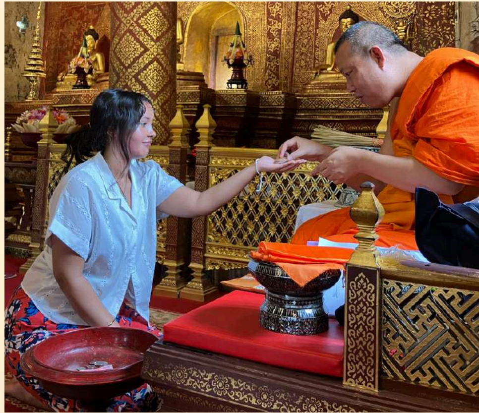
Sai Sin Blessing; a monk ties a white string on your wrist as a symbol of good luck, protection