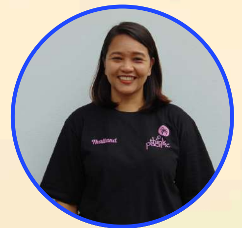
Oil Operations Manager